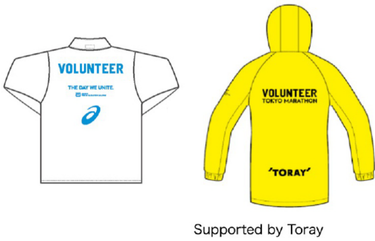
Supported by Toray

In the past, the volunteer uniforms had the year of the tournament printed on them, but as the new uniform design does not feature a year logo, these new uniforms can be worn regardless of the tournament year. Further, plant-based synthetic fiber "Ecodear®" is used for the volunteer uniforms.