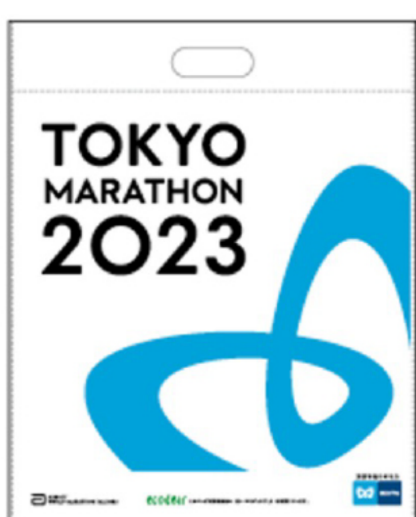
Supported by Toray

We will use environmentally friendly synthetic fibers (Ecodear®) derived from plants as fabric for volunteer wear and EXPO bags.